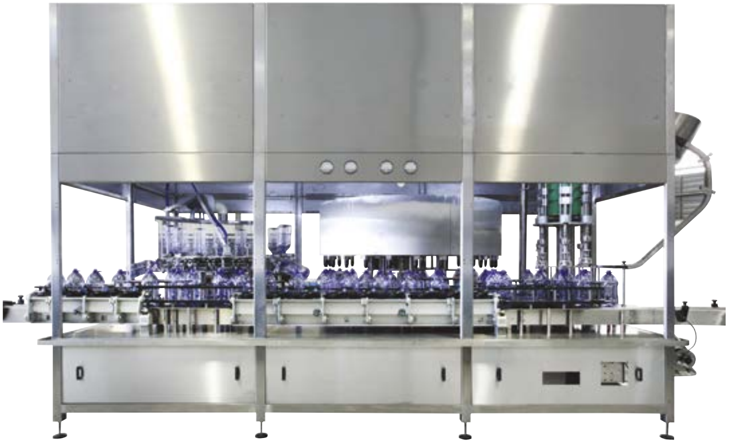
Rotary Rinser Net Weight Filler Capper Specialised for 5L bottles at 4000 bph